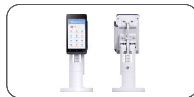
Flexible placement to suit different business settings.