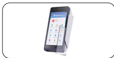
Supports magnetic card reader.