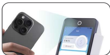
Clear transaction indicator lights.